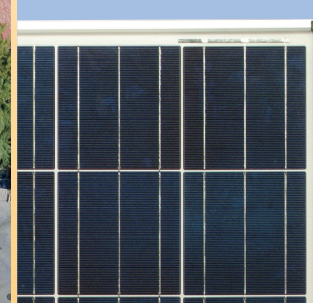
Sharp multi-purpose modules offer outstanding performance for a variety of applications.